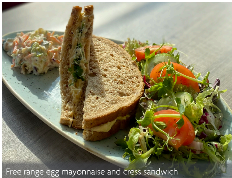
Free range egg mayonnaise and cress sandwich