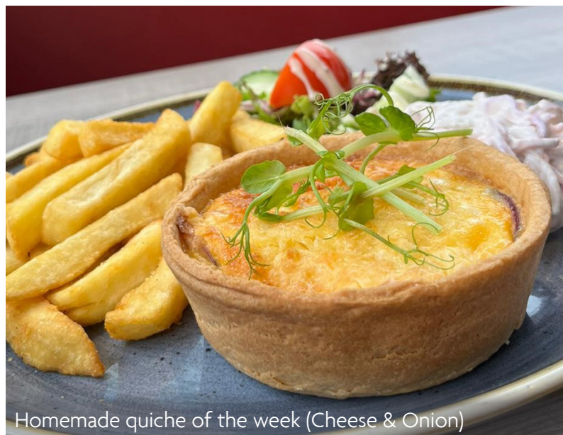
Homemade quiche of the week (Cheese & Onion)

Lunches and hot food are served from 11.30am until 3pm Monday to Saturday, and from 11.30am until 2.30pm on Sundays and Bank Holidays.