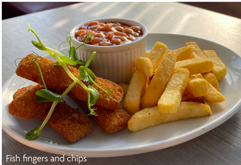
Fish fingers and chips

Lunches and hot food are served from 11.30am until 3pm Monday to Saturday, and from 11.30am until 2.30pm on Sundays and Bank Holidays.