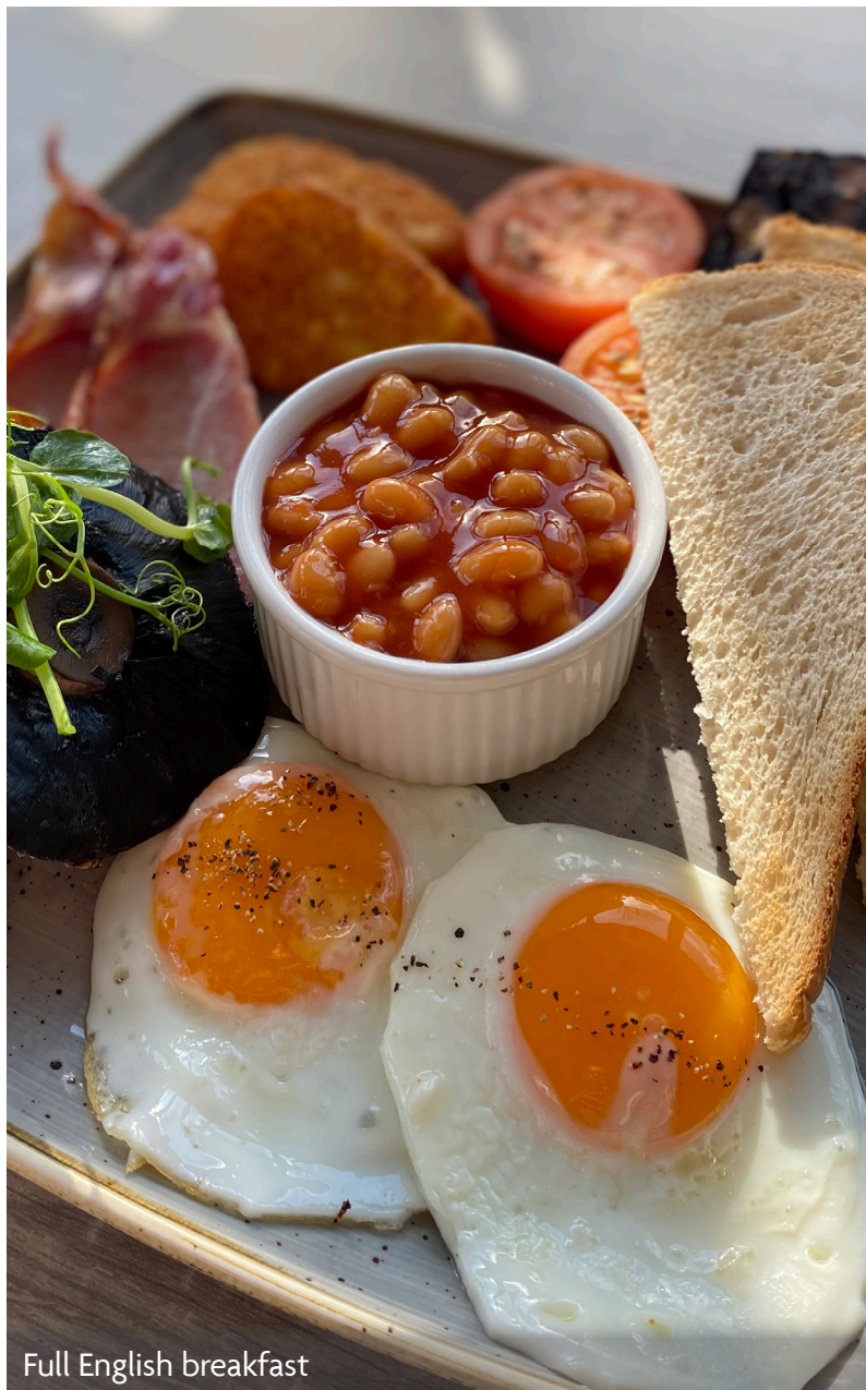
Full English breakfast

Served from 9am until 11am Monday to Saturday, and from 10am until 11am Sunday & Bank Holidays.