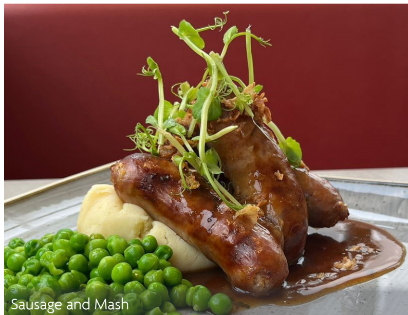
Sausage and Mash