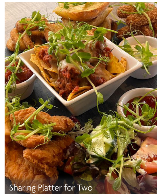
Sharing Platter for Two

Please inform your server of any food allergies/dietary requirements you may have when ordering or ask for our allergies folder.