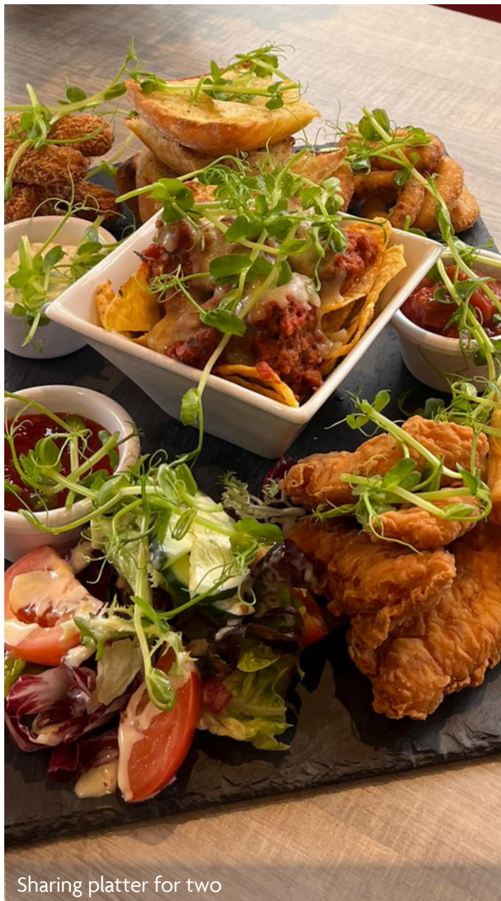
Sharing platter for two