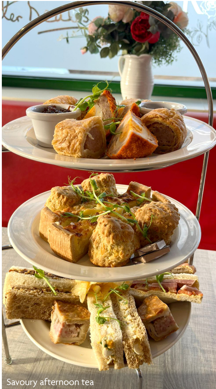
Savoury afternoon tea