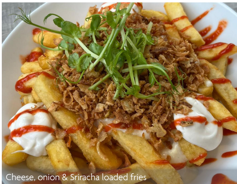
Cheese, onion & Sriracha loaded fries