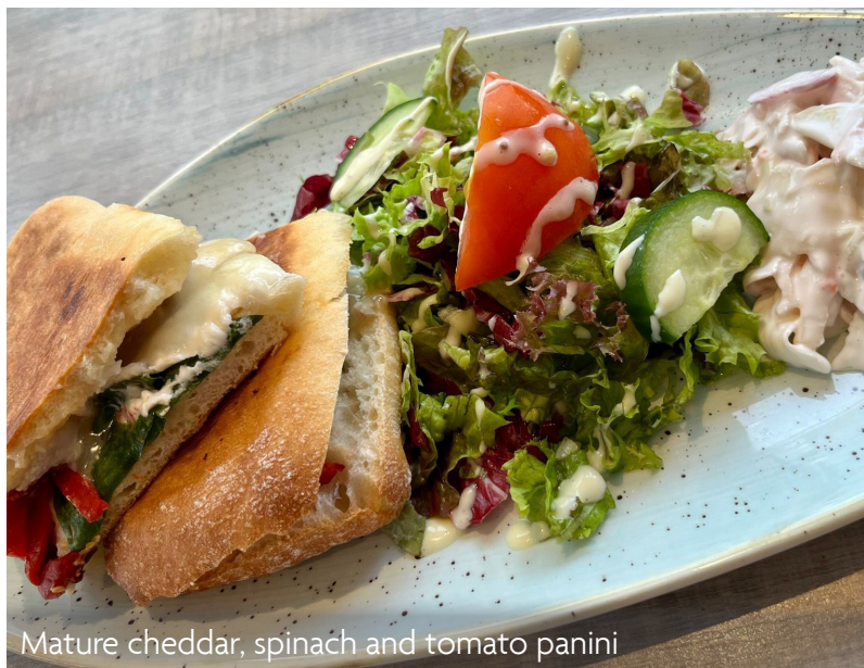
Mature cheddar, spinach and tomato panini

SANDWICHES - On malted, white or gluten free bread. Served with a salad and coleslaw.